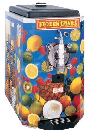
Shown with optional panel decals