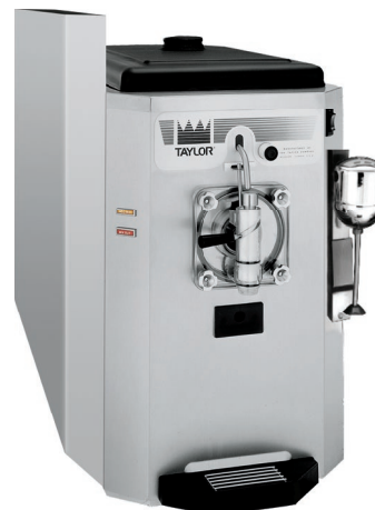
Shown with optional top air discharge chute & panel spinner