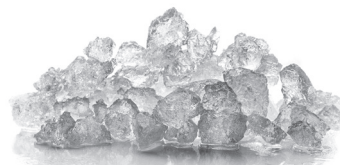
Residual water content 15%