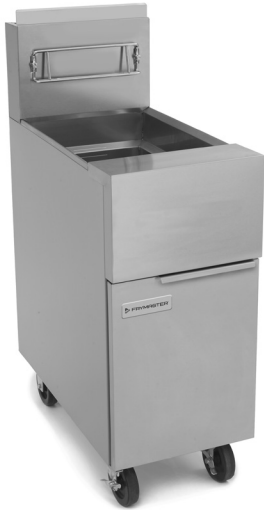
GF40 Shown with casters